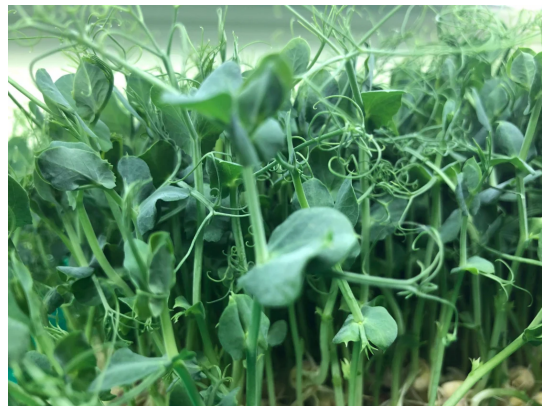
Tendril-Rich Pea Microgreens