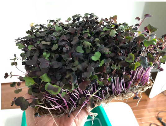
A Pad of Rambo Radish

In this newsletter: Raw Power & Mandarin Microgreen Salad!